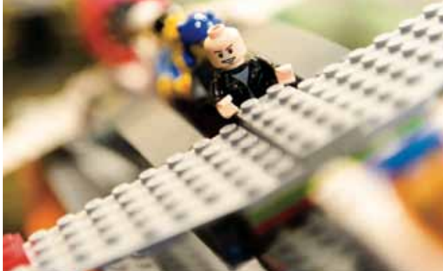
■ This space could be one of the most hard-working rooms in the house, serving as homework headquarters, art studio and computer network — sometimes all at the same time.